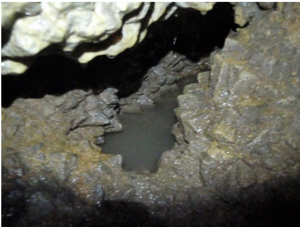
Small pool in recess on wall in Second Chamber