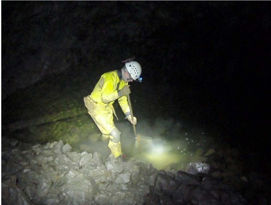
Sampling in the lake margins. Note submerged timber in shallow water behind sampler

http://www.penparkhole.org.uk/gallery/index.html