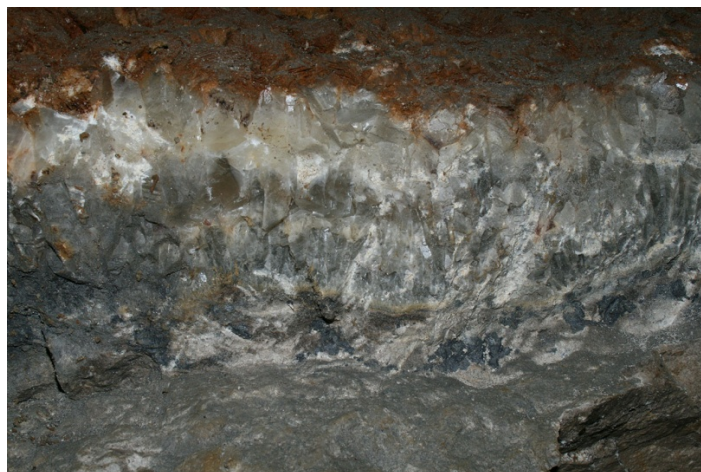
Large calcite crystals containing galena deposits, First Chamber