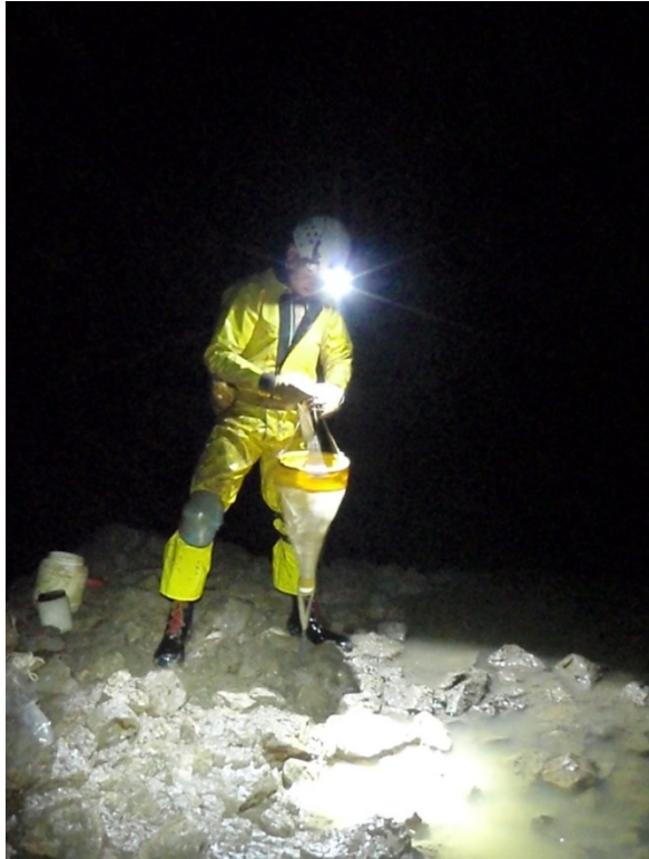
Sampling lake with trawl net from rocky spur