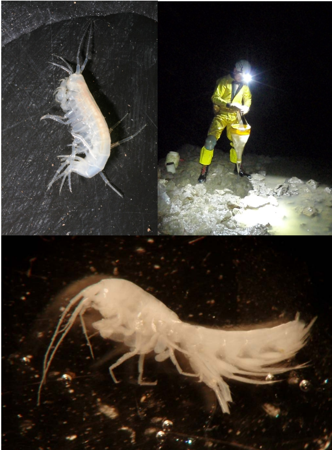
Top left: Niphargus fontanus ; top right: sampling the lake; bottom: Niphargus kochianus