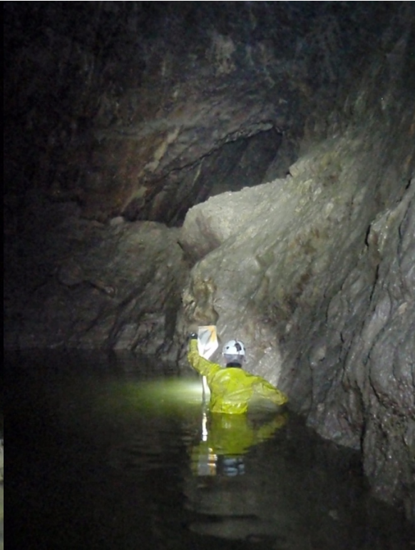
Traversing across to entrance to East Passage