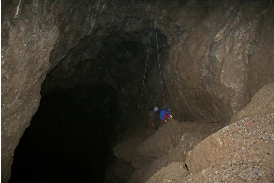
The Ledge, photographed from West Platform