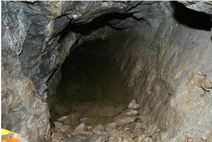
First Chamber pool